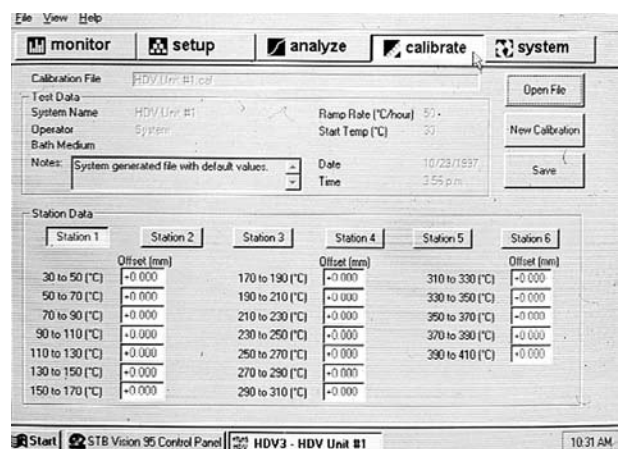
The Calibrate Menu

The HDV3 calibration function offers the ability to correct for test frame distortion at high bath temperatures. This simple frame calibration procedure is optional, and suggested if the material failure point is below 190°C. The system will automatically incorporate calibration file values in test result calculations to provide the most accurate test data for high temperature tests.